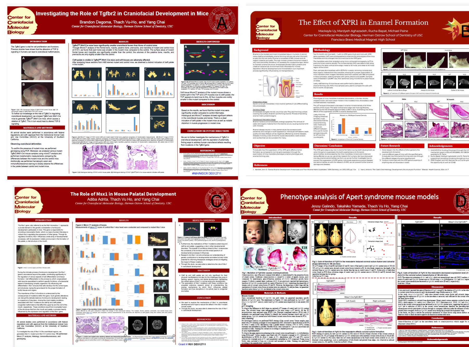
Figure 3 Students' poster presentations at the research symposia. A&C- Posters from STAR students. D-Poster from Jumpstart students.